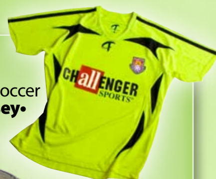
Official British Soccer Jersey

Watch the Barclays Premier League live on Setanta Sports Television