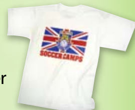
FREE British Soccer T-Shirt