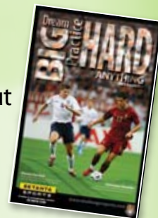
FREE GIANT, Fold Out Poster

All this! Plus the most innovative camp curriculum in the USA and a magical camp experience from qualified British coaches who really know how to make learning fun!